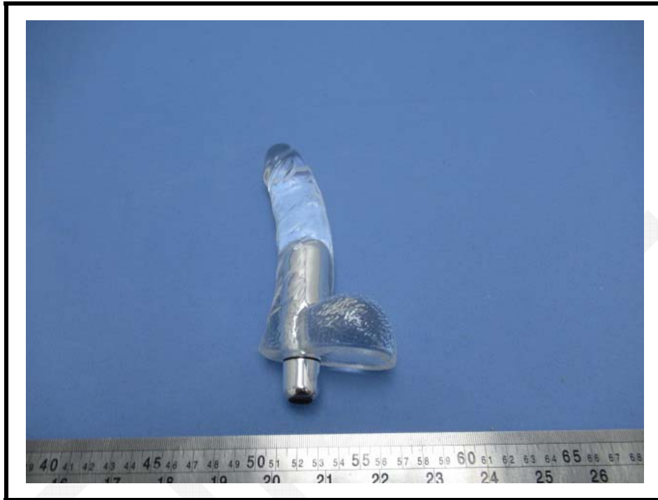
Photograph of Sample

BACL authenticate the photo on original report only